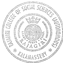
Controller of Examinations